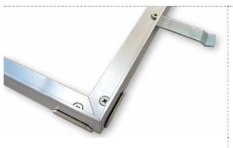
Frame with corner connector and anchor (delivered without installation)