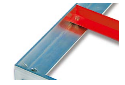
Red angle profiles provided as an installation aid for frames with over 2 m side length